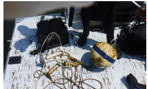
Data Logger Retrieval