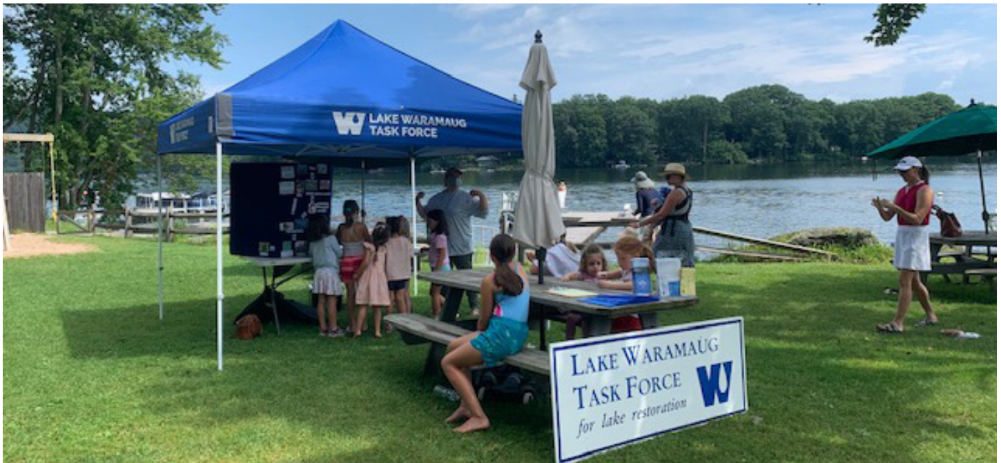
Lake Food Web Demonstration

Every year, the Task Force sets out to educate the next generation of lake stewards, the kids who will one day take up the mantle of protecting our great Lake. This summer, we continued this tradition through two Lake Explorer Days at the Lake Waramaug Country Club and the Washington Club beach.