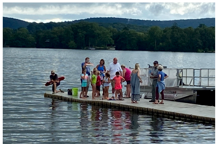
Lake Sampling Equipment Demonstration

they learned about - from the plankton tow that measures the zooplankton in the water, to the lake rake that helps uncover aquatic plants. By the end of the hour-long program, students developed a deep appreciation for the vast array of life that lives and balances the Lake, as well as all of the work the Task Force needs to do to keep the Lake healthy.