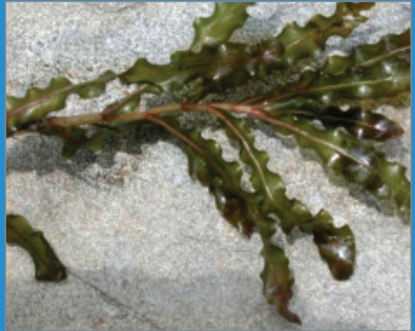
CURLY LEAF PONDWEED